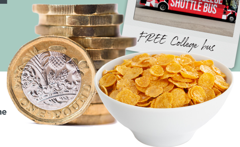
FREE College bus