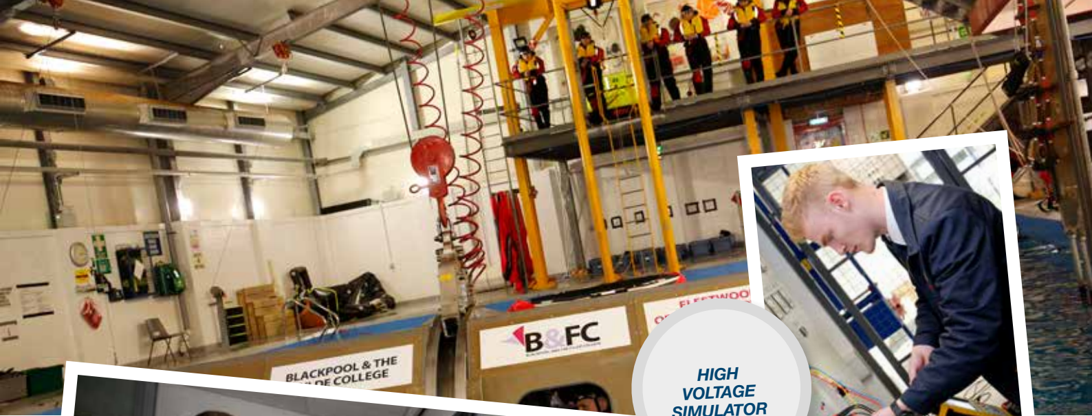
HIGH VOLTAGE SIMULATOR