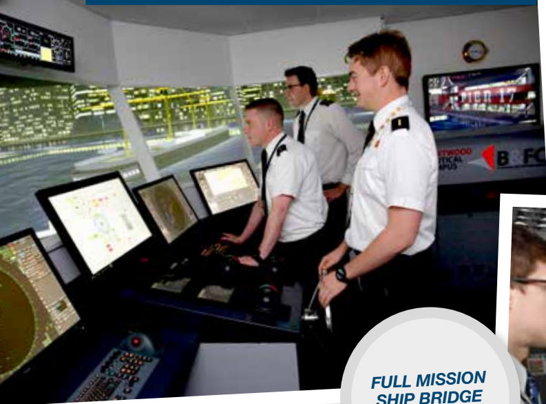
FULL MISSION SHIP BRIDGE SIMULATORS

CONSTANT INVESTMENT IN OUR FACILITIES MEANS THE LATEST TECHNOLOGY AND RESOURCES AT OUR AMAZING PURPOSE-BUILT CAMPUS.