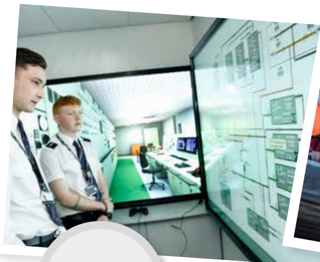
FULL MISSION SHIP BRIDGE SIMULATORS