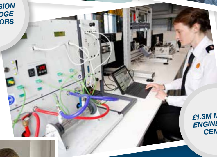
£1.3M MARINE ENGINEERING CENTRE